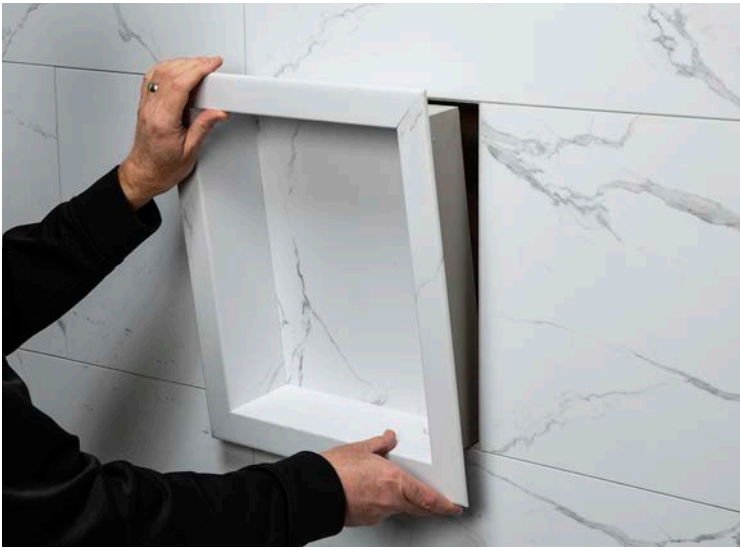
Carefully place the shower niche into the opening.