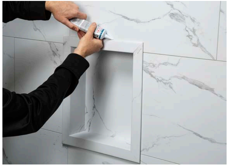
Once it is in place, wipe off any excessive sealant. As added protection, you can place a small bead of sealant on the top edge only.