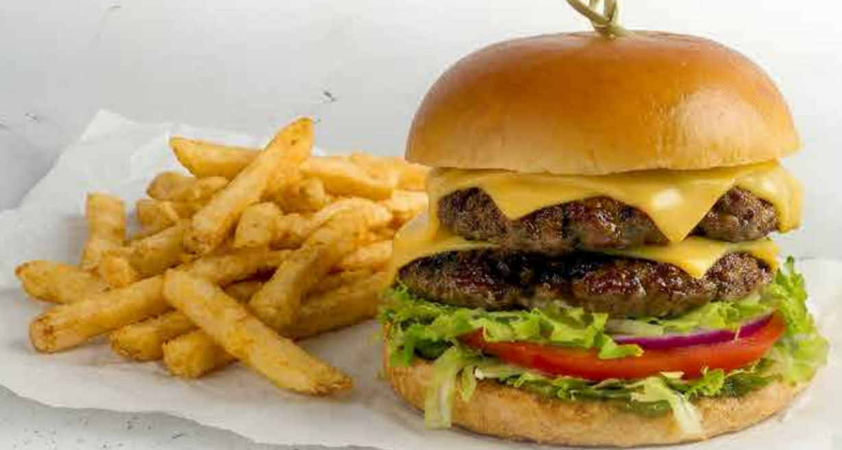
DOUBLE STACK SMASH BURGER