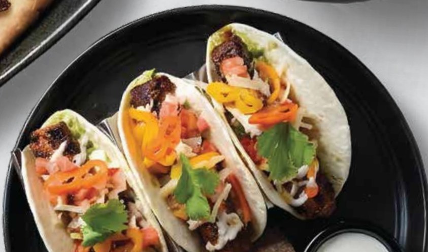
BLACKENED MAHI TACOS