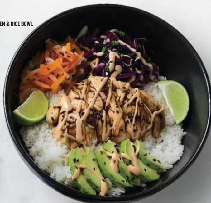
CHICKEN & RICE BOWL