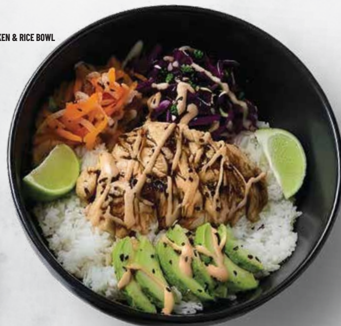
CHICKEN & RICE BOWL