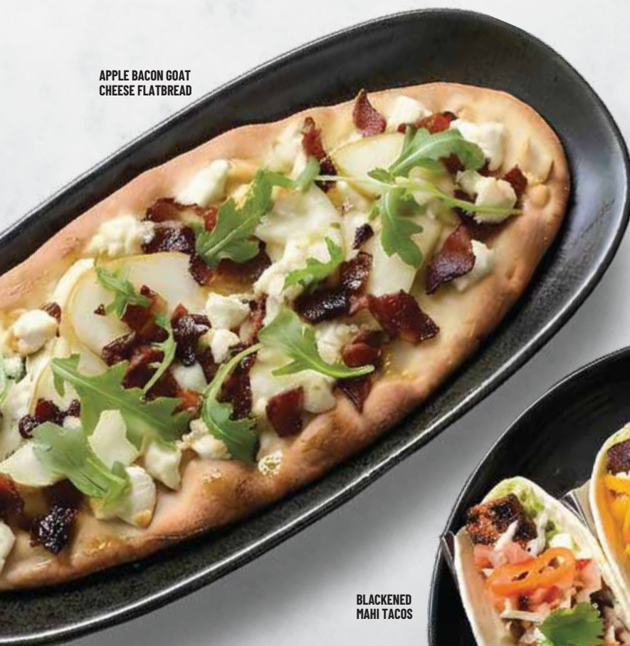
BLACKENED MAHI TACOS