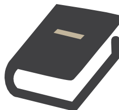
Assignee to a retail book chain