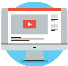
Assignee to a streaming media distribution company