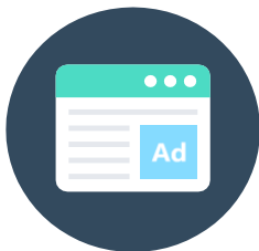
Assignee to an ad-tech company