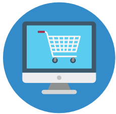
Assignee to an online publicly traded gift and greeting card company