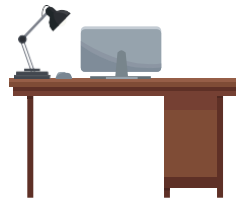
Assignee to a shared office workspace company