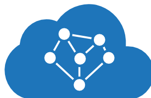
Assignee to private cloud connectivity company