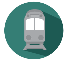
Assignee to a high speed mass transit solution provider