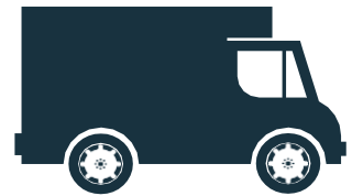
Assignee to an online logistics company