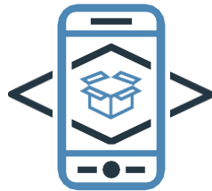
Assignee to an augmented reality company