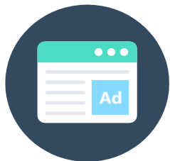
Assignee to an ad-tech company