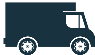
Assignee to an online logistics company