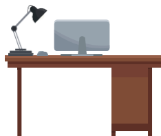
Assignee to a shared office workspace company