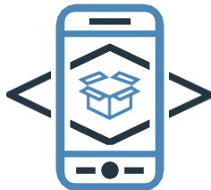
Assignee to an augmented reality company