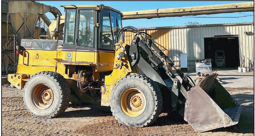
CAT TOOL CARRIER