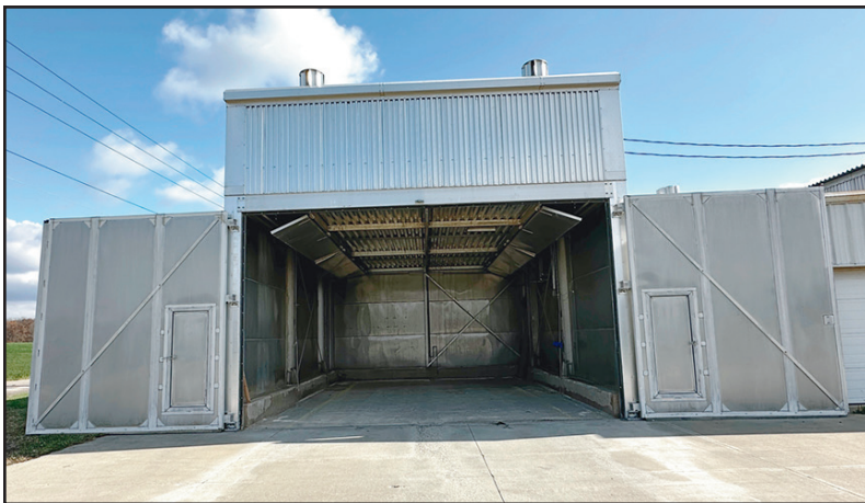
SII DRY KILN