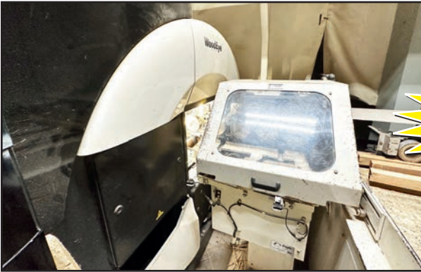
EAGLE WOODEYE V DEFECT SCANNING SYSTEM