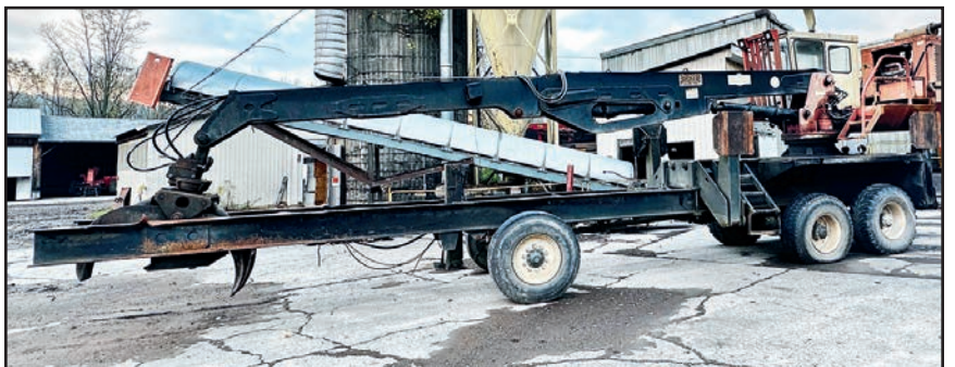
BLOOM LOG CRANE