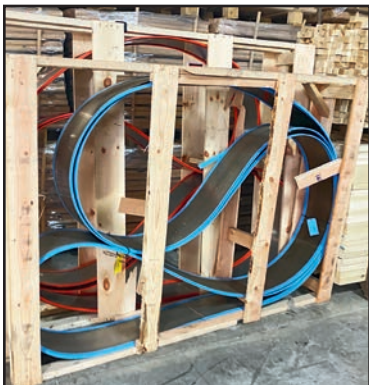
NEW BAND SAW BLADES