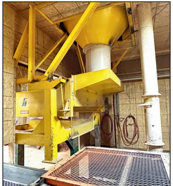
FULGHAM ROTARY CHIP SCREEN WITH FEED HOPPER

(4) COMPLETE LUMBER MILLS WITH ALL EQUIPMENT & REAL ESTATE