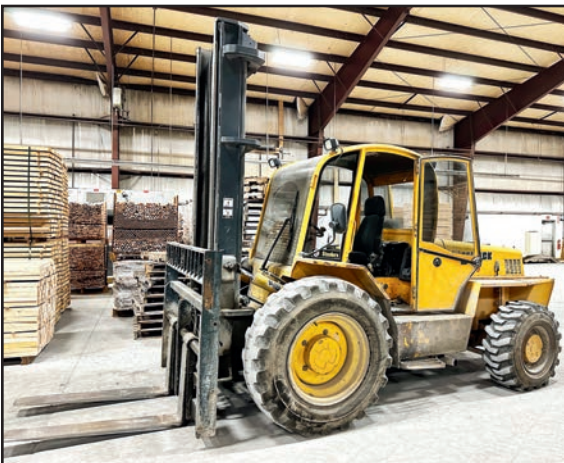
SELUCK DIESEL FORKLIFT