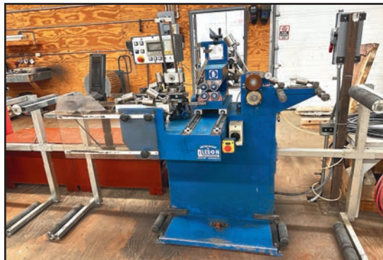
MEC-LEGNO BAND SAW GRINDER

Champion, Pennsylvania Dexter City, Ohio Unadilla, New York Pine Valley, New York