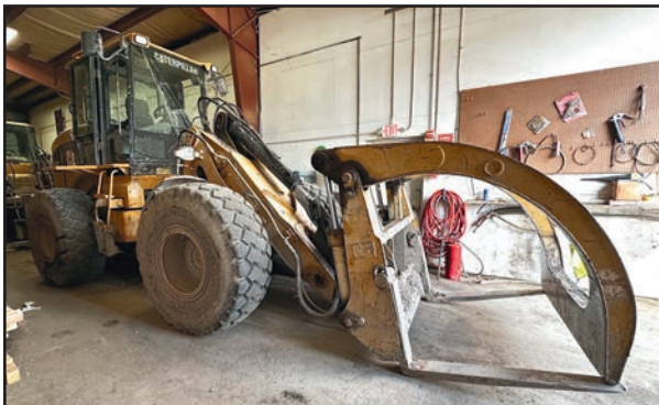
CAT WHEEL LOADER WITH GRAPPLE