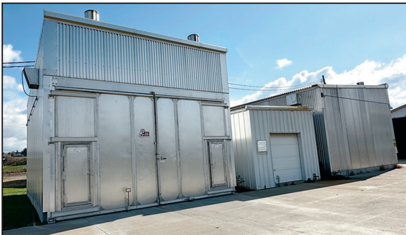
SII DRY KILN