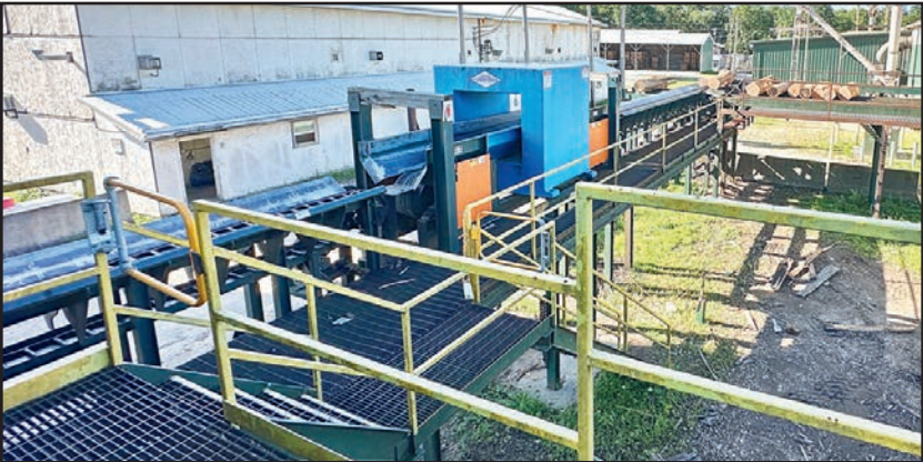
LOG CONVEYOR WITH METAL DETECTOR