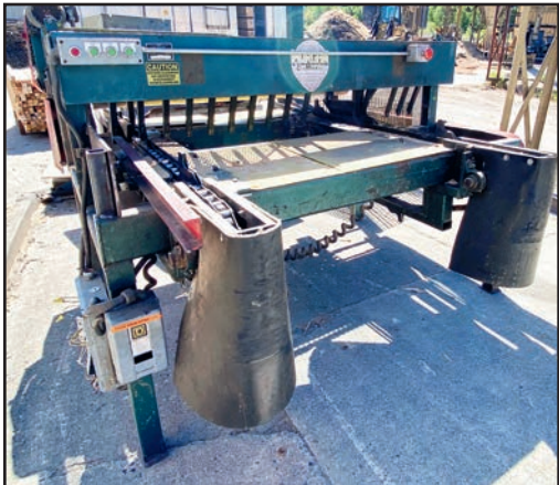
MORGAN DOUBLE END TRIM SAW