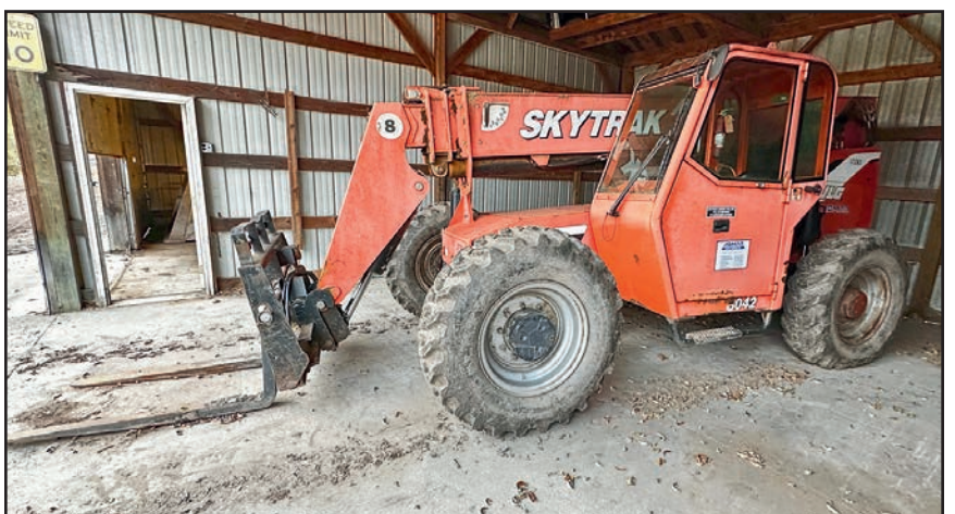
SKYTRAK 8042 TELEHANDLER