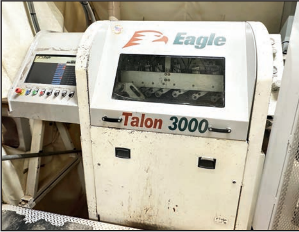
EAGLE TALON 3000 PROGRAMMABLE HIGH SPEED CROSSCUT SAW