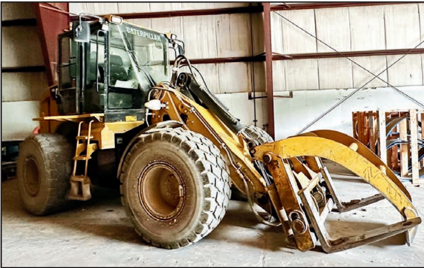
CAT 930H WITH GRAPPLE - FRONT VIEW