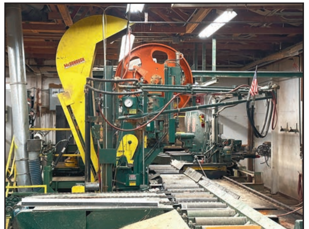
MCDONOUGH HEAD SAW