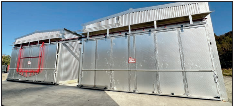
(NEW) SHI DRY KILNS (NEVER USED)

For more information, and to view aerial and saw line video footage, visit www.crgllc.com