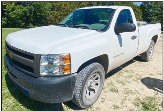
SILVERADO 4 X 4 PICKUP TRUCK

For more information, and to view aerial and saw line video footage, visit www.crgllc.com Surplus to the Continuing Operations of Ames