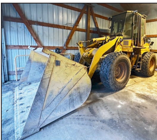
CAT 924 F WHEEL LOADER