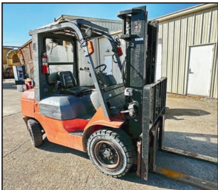
TOYOTA 6,000-LB. CAPACITY FORKLIFT