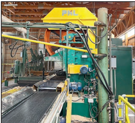
CLEERENAN-PHL 48" BAND MILL WITH 3-HEAD BLOCK