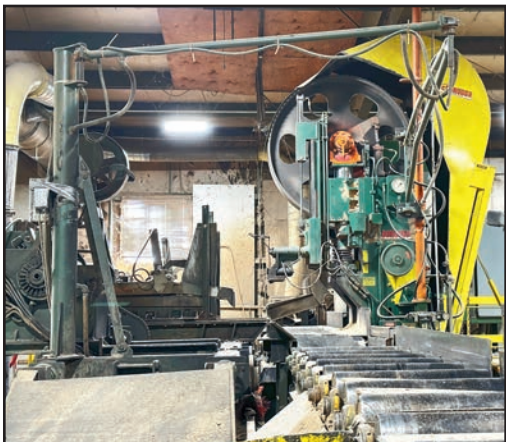
MCDONOUGH HEAD SAW WITH CLEERMAN BLOCK