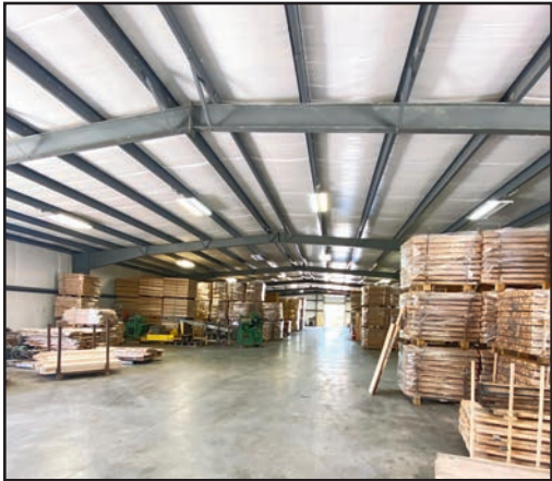
CLEAR SPAN WAREHOUSE BUILDING