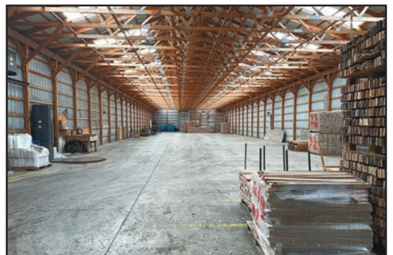
NEWLY CONSTRUCTED WAREHOUSE BUILDING

All 4 sites are immediately available for private treaty sale as a complete package, or individually. All equipment has been well maintained and ready to continue operating!