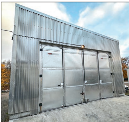
2018 NYLE DIRECT FIRE PROPANE KILN

(4) COMPLETE LUMBER MILLS WITH ALL EQUIPMENT & REAL ESTATE