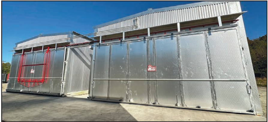
(NEW) SII DRY KILNS (NEVER USED)