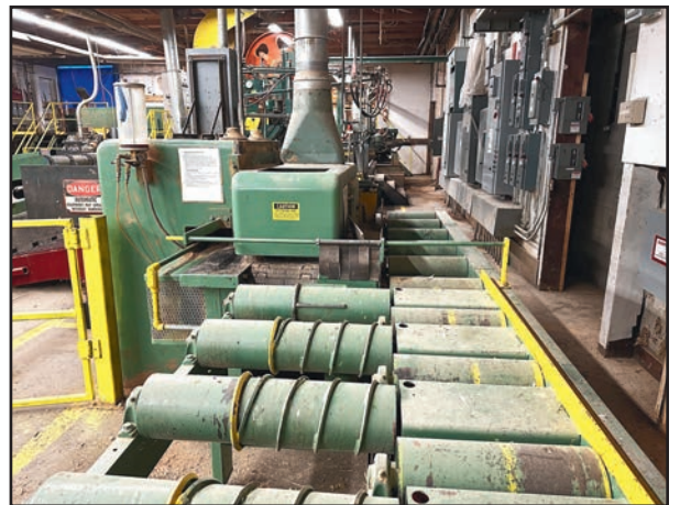
STETSON ROSS GANG RIP SAW