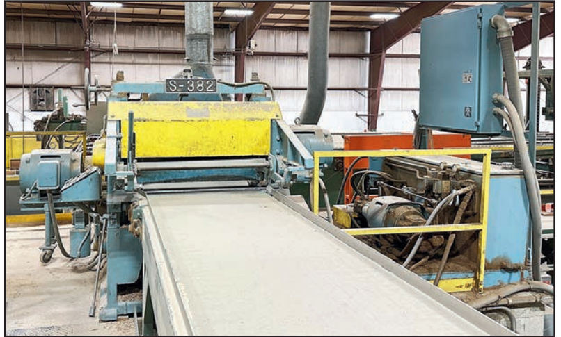
NEWMAN S-382 DOUBLE HEAD PLANER