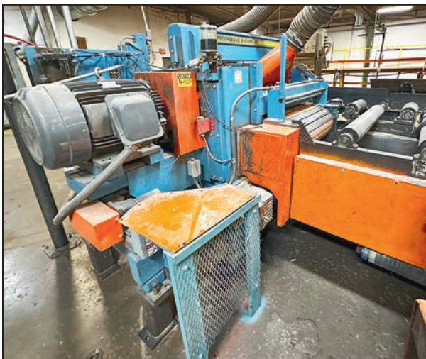
PROGRESSIVE SYSTEMS GANG RIP SAW