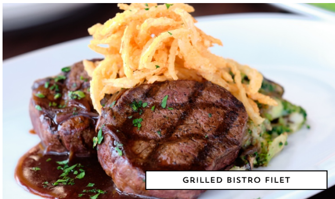
GRILLED BISTRO FILET