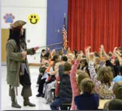
Youngs Grove Elementary

Elementary in Cedartown and Glenwood Elementary