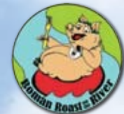
ROMAN ROAST on the RIVER

The Savings Crew sponsored the Kids Area!