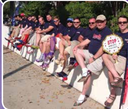
The staff of Coosa Valley "Walking a Mile in Her Shoes" to raise awareness for domestic violence.