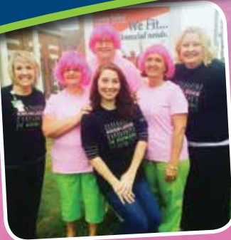
Coosa Valley Staff along with staff from Floyd Medical Center supporting 2015 Paper Doll Campaign for Breast Cancer