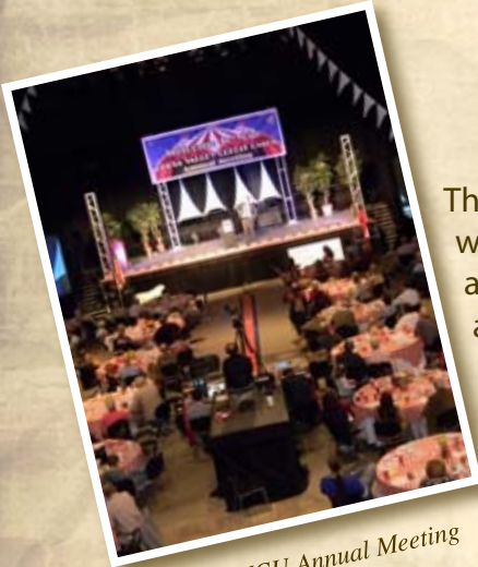
2011 CVCU Annual Meeting

The Coosa Valley Annual Meeting was a state fair with a flair! Cotton candy, popcorn, candied apples, lemonade, hot dogs, hamburgers and all the trimmings were available in endless supply to all of the attendees. Over 700 people packed The Forum in Rome for a celebration of the accomplishments of Coosa Valley Credit Union!